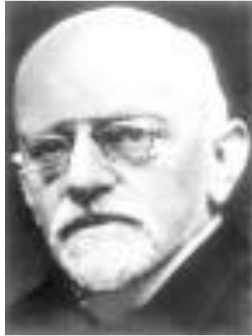
David Hilbert (1862-1943)

Let's devise a complete and finite set of axioms from which all true statements can be derived.