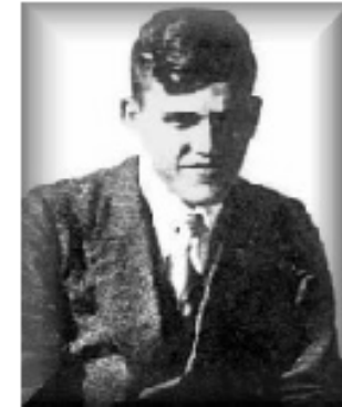
Gerhard Gentzen (1909-1945)

Gentzen introduced a formal system which modeled mathematical reasoning quite directly