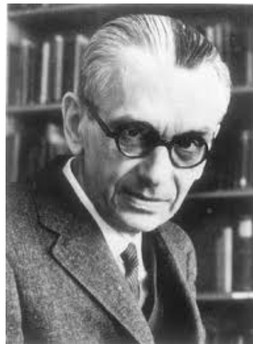
Kurt Gödel (1906-1978)

Gödel in 1935 published his incompleteness result.