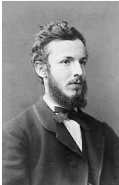
Georg Cantor (1845-1918)

At the beginning of the 19th century set theory was born