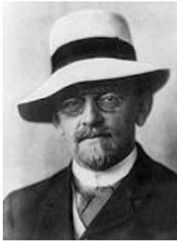
D. Hilbert (1862-1943)